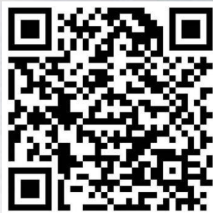
QR code Registration